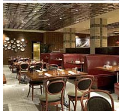
Top to Bottom: Blue Duck Tavern, Washington; Bacar, San Francisco; Dine, Chicago