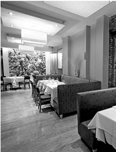
Telepan, New York